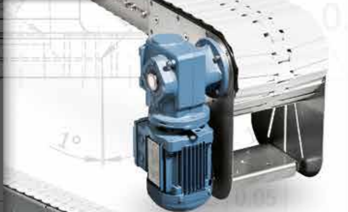
ETS Head Drive

The Easy Conveyors concept is based on long experience in R&D and continuous quality improvement of product conveyor systems. On this base we continuously developing competitive products for our customers worldwide.